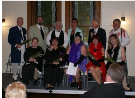
Photo from Murder at the Red Rock Speakeasy April 2014